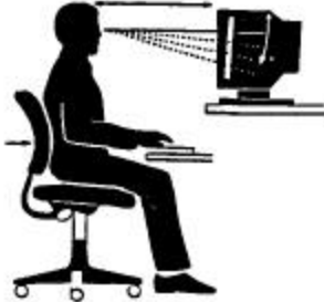
Knees about the same level as hips or lower.

Use Good Posture – A slouching posture is more likely to place the wrists and elbows in a poor position for a task